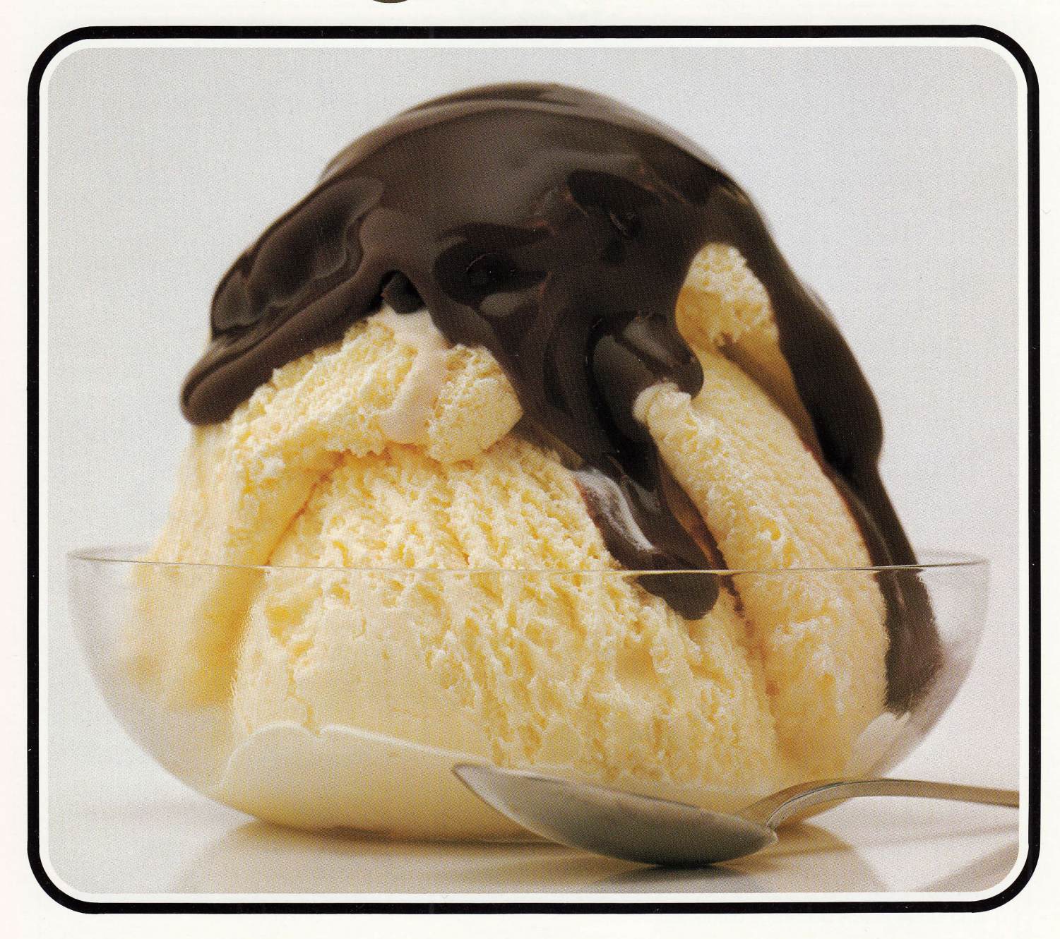
JHS offers a wide variety of high quality Fudges, Toppings and Fountain Syrups.