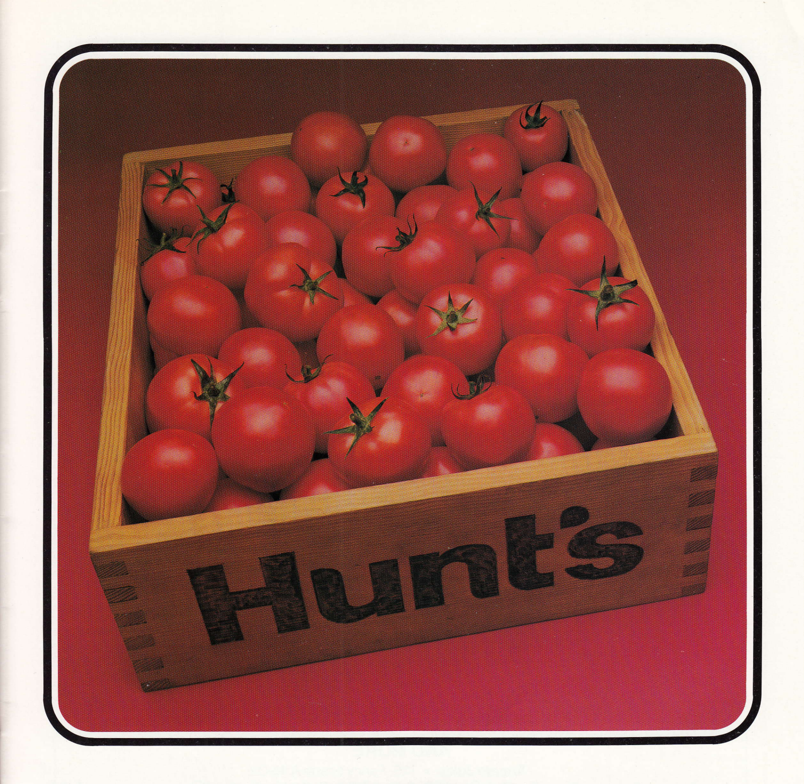
Hunt's® Nearly a century of excellence in foodservice.