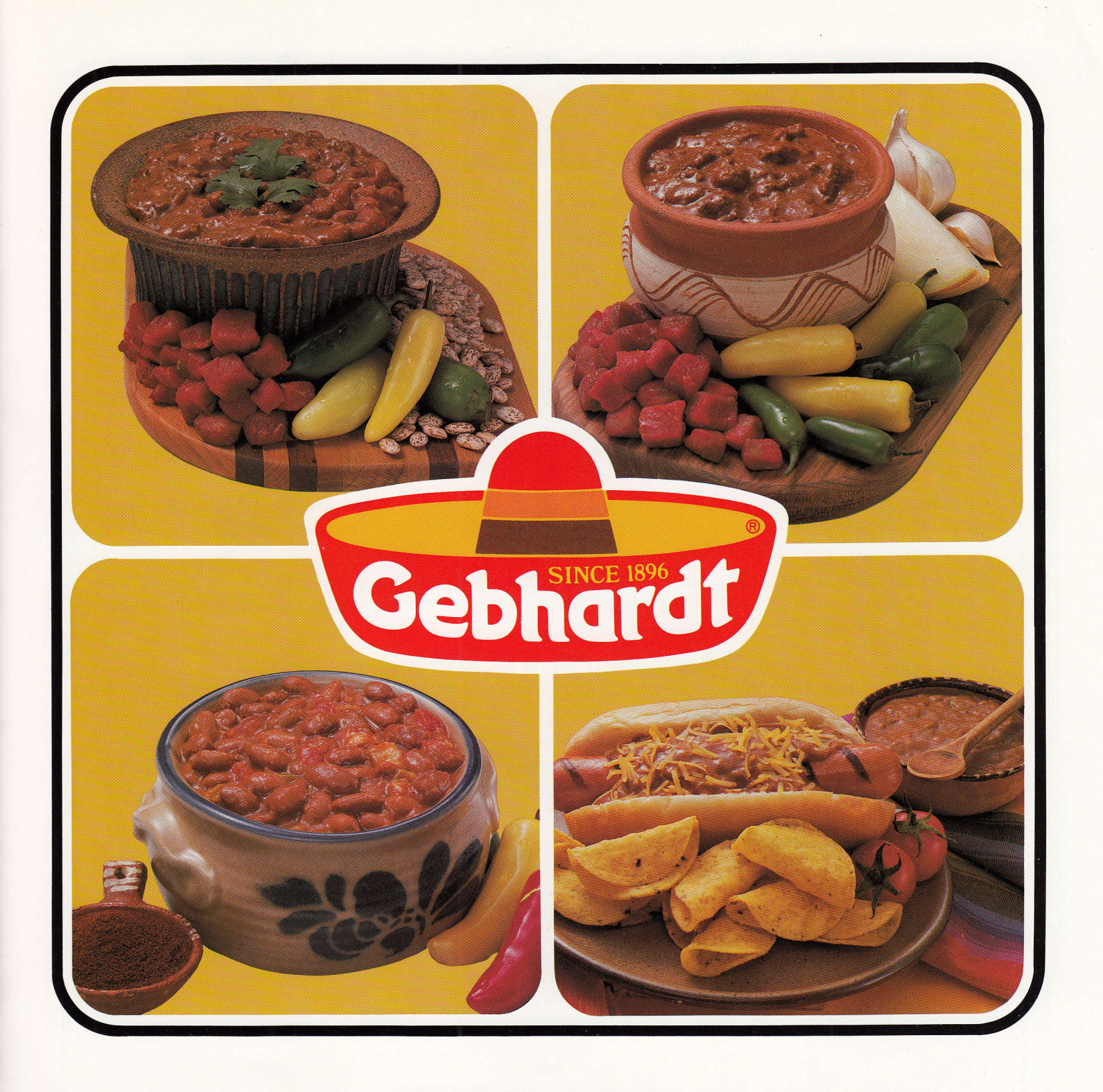
Gebhardt® invented Chili Powder in 1896, and offers a popular variety of Chili-related products.