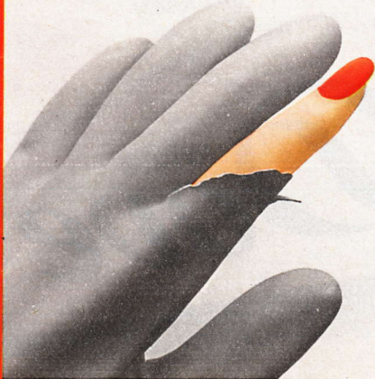
ORDINARY LATEX GLOVES